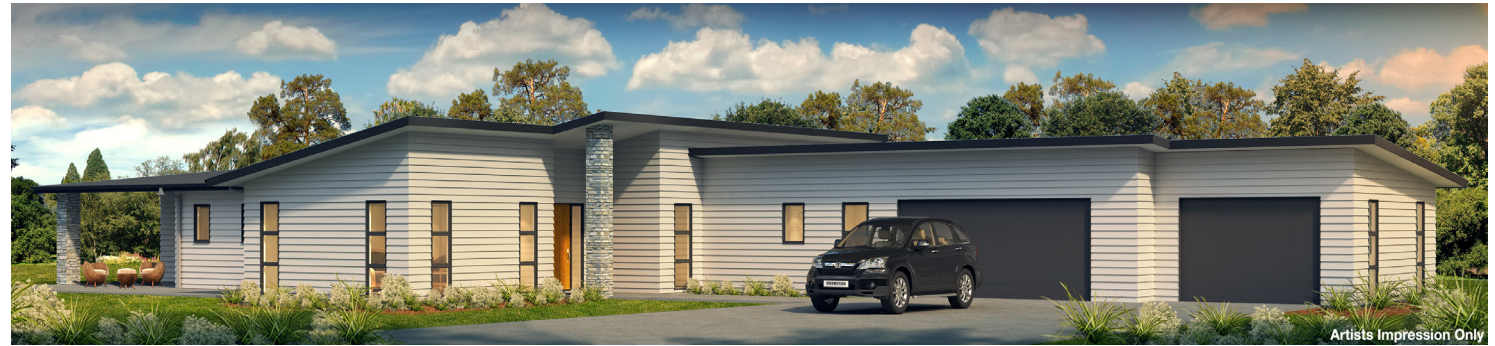
Artists Impression Only